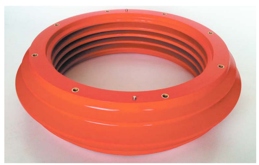
Signet 30-1012 Enhanced H V Source Bushing

Signet Products offers this replacement bushing for the VSEA VIISta Implanter. It is an enhanced design offering improved performance through both its configuration and the composite material used.