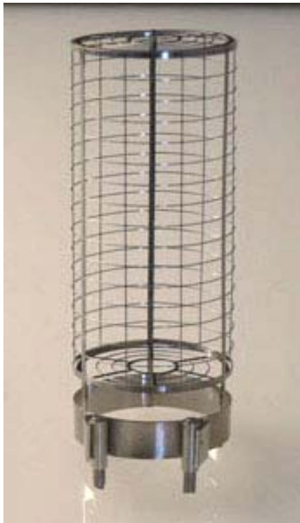
Signet Part Number 30-0096 Replacement Grid Assembly