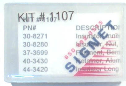
Signet's convenient kit packaging

Reference Note: See also the 1043 Kit Data Sheet PDS1043